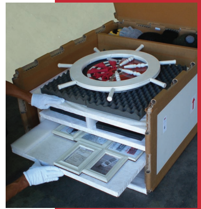
Multi level crate for mixed media