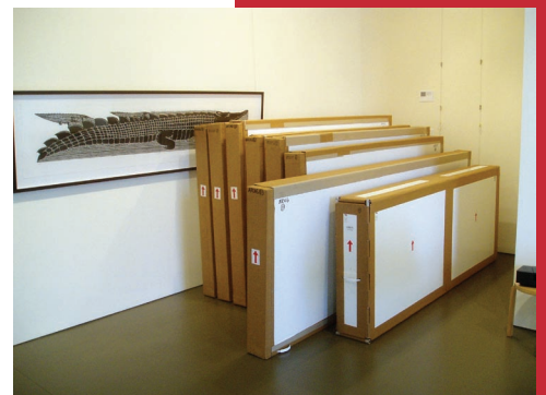
Painting crates at gallery