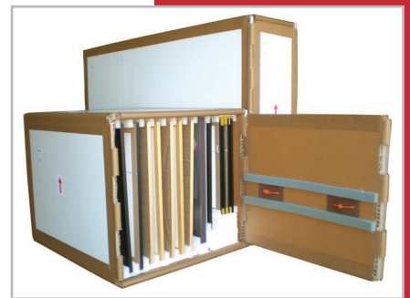
Slot box crate with vertical supports