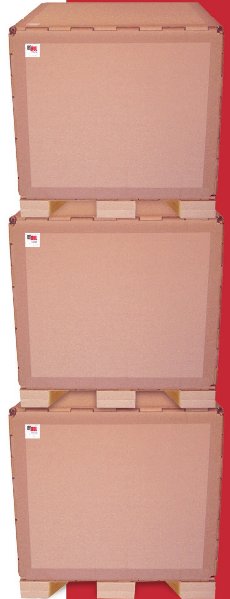
Stacked - 1 cubic metre crates with 1 tonne in each