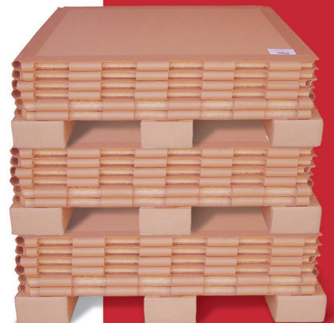
Flat pack for storage, delivery and reuse.