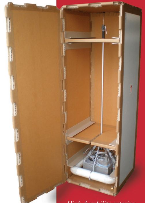
High durability exterior. Multi-use crate with internal supports