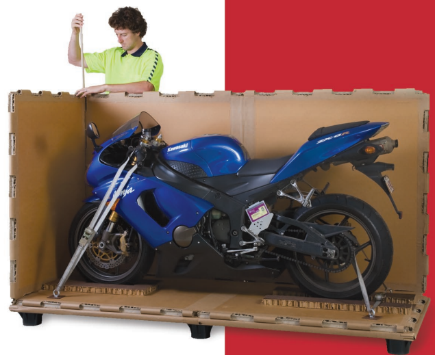
Quick, simple and secure